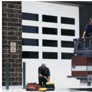
TC Series, TC300

Raynor also offers a full line of sectional, rolling, fire, high performance and traffic doors, as well as, security grilles. See your Raynor Dealer or visit www.raynor.com for more information.