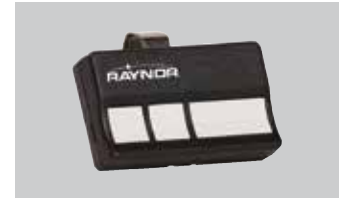
3 Button Transmitter